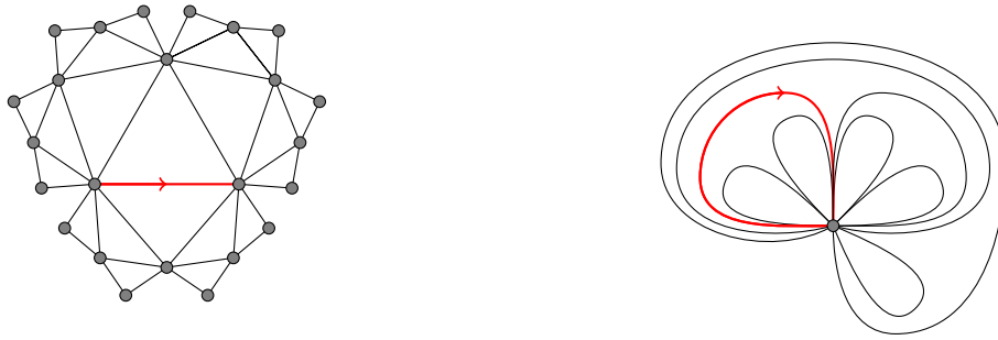
Figure 1.1. The beginning of the construction of \mathbb{T}_0 (on the left) and \mathbb{T}_\star (on the right). Note that these are two different triangulations: \mathbb{T}_0 has infinitely many vertices whereas \mathbb{T}_\star has only one.

\mathbb{T}_\lambda to the case \lambda = 0 . On the other hand \mathbb{T}_\star (on the right of Figure 1.1) is the only infinite, planar triangulation with only one vertex: it is obtained by forming a triangle with three loops, and then recursively adding two loops inside of each loop to form new triangles. We highlight that our definition considers \mathbb{T}_0 and \mathbb{T}_\star as two distinct objects, even if they have the same dual. Indeed, the vertices are not glued in the same way in \mathbb{T}_0 and in \mathbb{T}_\star . We are now able to state our main theorem.